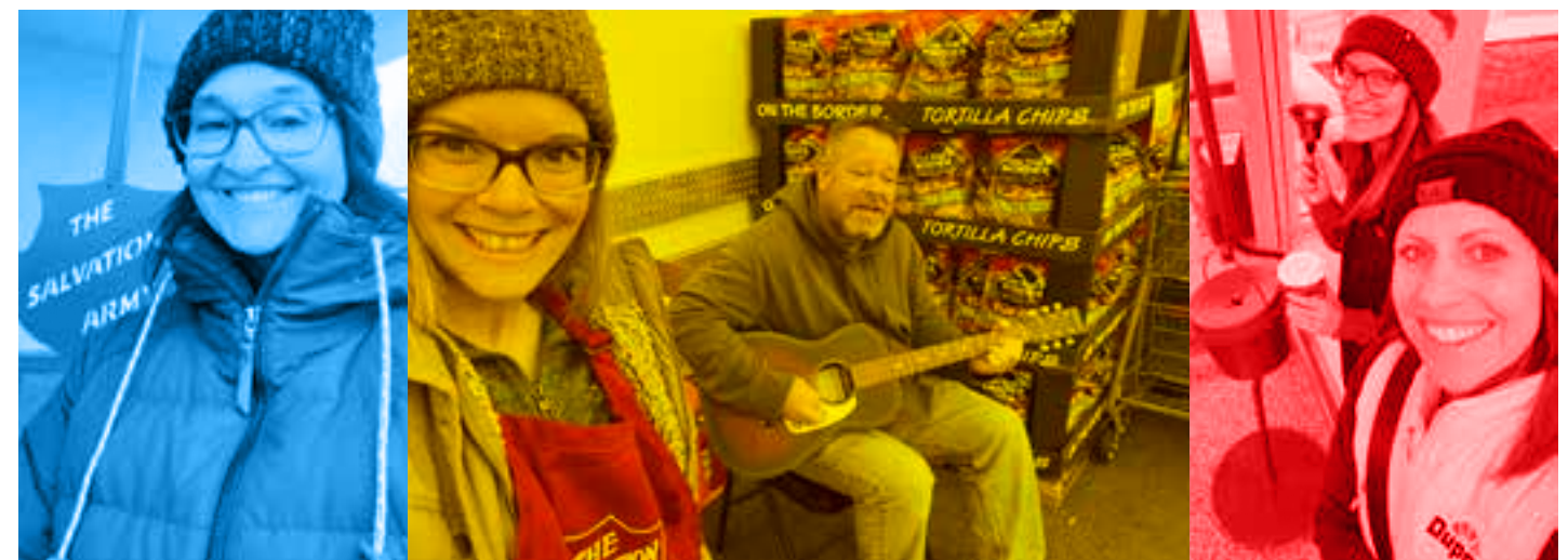
▲ SCENE IN: 2023 Dupaco marketing team members use volunteer time off at multiple locations to help The Salvation Army's Red Kettle Campaign raise funds for people in need.

Dupaco invested 17,671 hours in employee training. (Hint: That's about 26 hours per employee in formal learning experiences!)