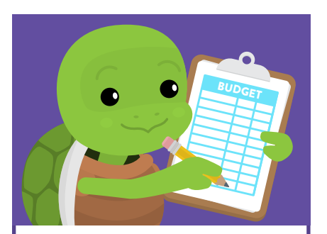
Junior makes a budget to plan out what he wants to buy