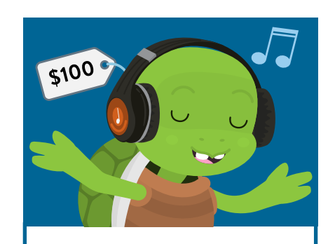
Junior borrows money to buy new headphones